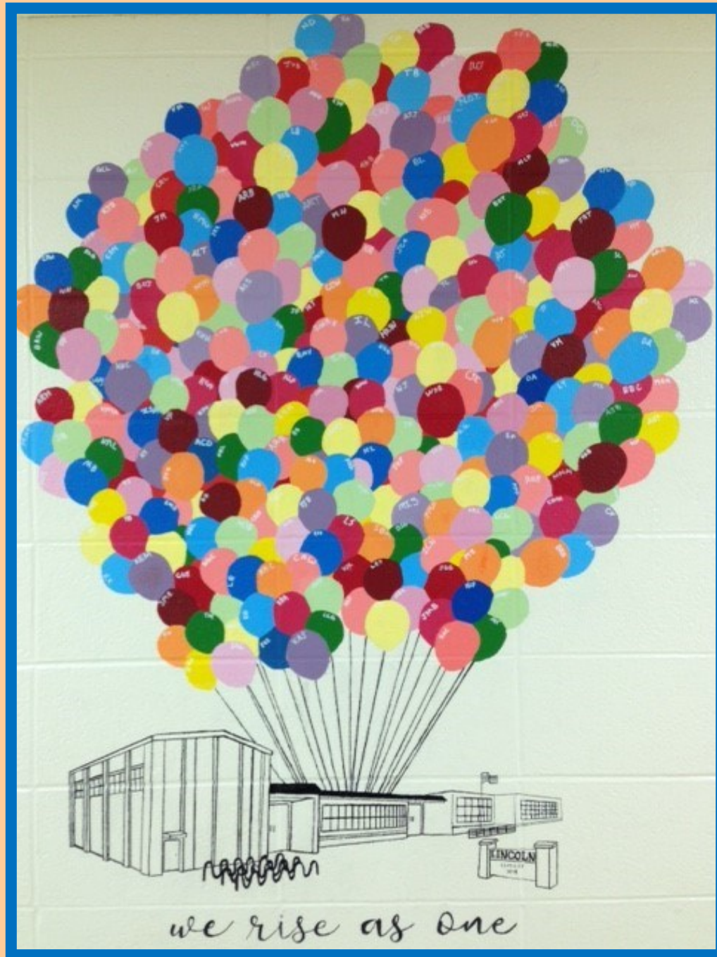
Artwork by Lincoln Mural Club

Congratulations! Best of Luck! Class of 2019